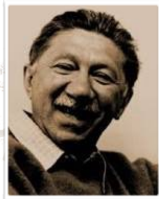
Abraham Harold Maslow was an American psychologist who was best known for creating Maslow's hierarchy of needs, a theory of psychological health predicated on fulfilling innate human needs in priority,

One need look no further than Maslow's Hierarchy of Needs to understand why many in the emerging world are not reaching their highest potential. An example of achievement would be Nobel laureates. The highest percentage of Nobel laureates are from Western nations. In my view, the reason for this is that those living in the West are able to achieve self-actualization.