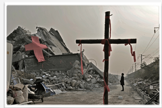
A woman stands looking at the remains of her business and church. Education has made her stronger. She resolves that this will not be the end but the beginning of a new chapter.

Education helps us understand that we can change the world - we can change the world by changing attitudes and by changing perceptions. This woman leader, like Nelson Mandela, will not allow her persecutors to determine her future. They may have destroyed her building but her soul remains intact. Her vision for the future is clear. She will stand firm in her resolve to be the change she wants to see in the world.